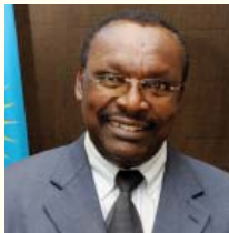
Hon. KANIMBA Francois MINICOM