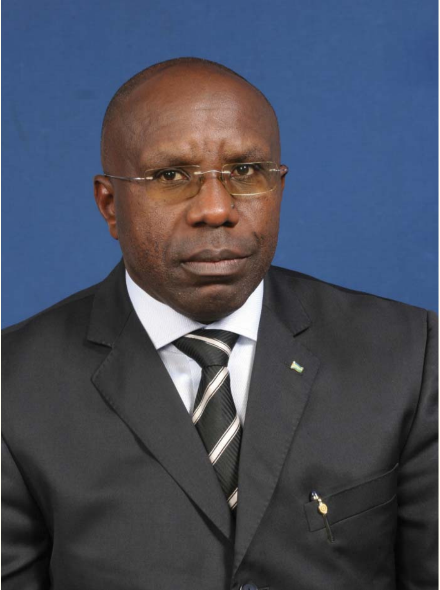
Rt. Hon. Pierre Damien HABUMUREMYI, Prime Minister