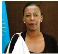
Hon. MUSHIKIYABO Louise MINAFFET