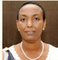
Hon. INYUMBA Aloysia MIGEPROF