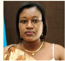
Hon. MUKARURIZA Monique MINEAC