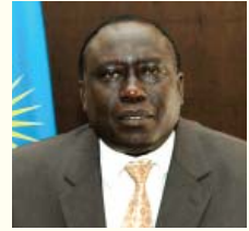
Hon. KARUGARAMA Tharcisse MINJUST