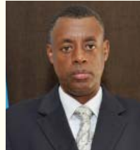
Gen. KABAREBE James MINADEF