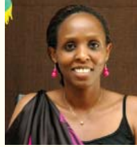
Dr. KALIBATA Agnes MINAGRI