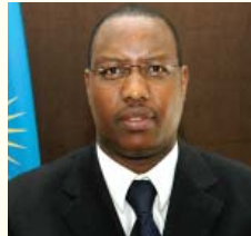
Hon. MITALI Protais MINISPOC