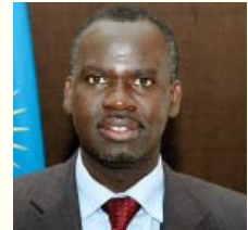
Hon. KAMANZI Stanislas MINIRENA