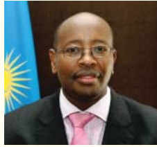
Hon. MUSONI James MINALOC