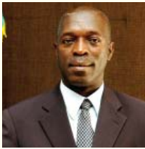
Hon. MUREKEZI Anastase MIFOTRA