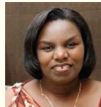
Hon. TUGIRAYEZU Venantie MINIPRESIREP