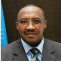
Hon. MUSONI Protais MINICAAF